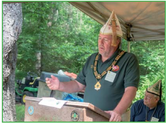
STC Metcalf addressing the members and candidates