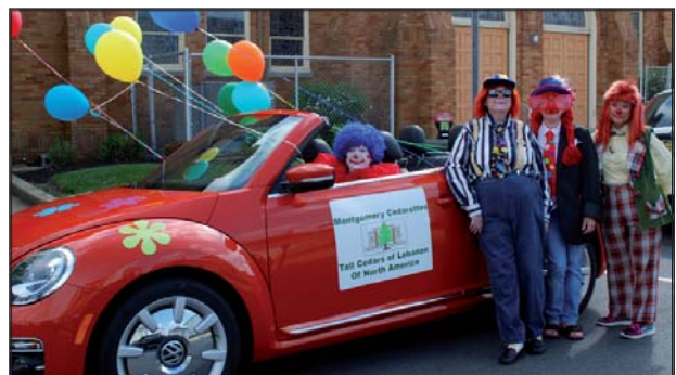
Montgomery Cedarette babes clowning around.