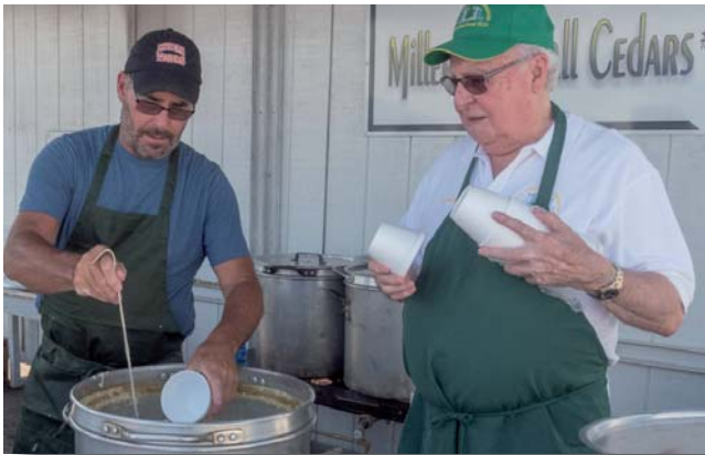
Serving clam chowder