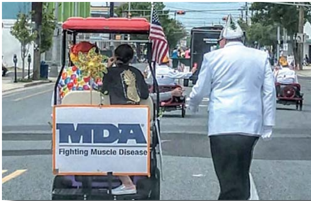
Took 1st Place for M D Float