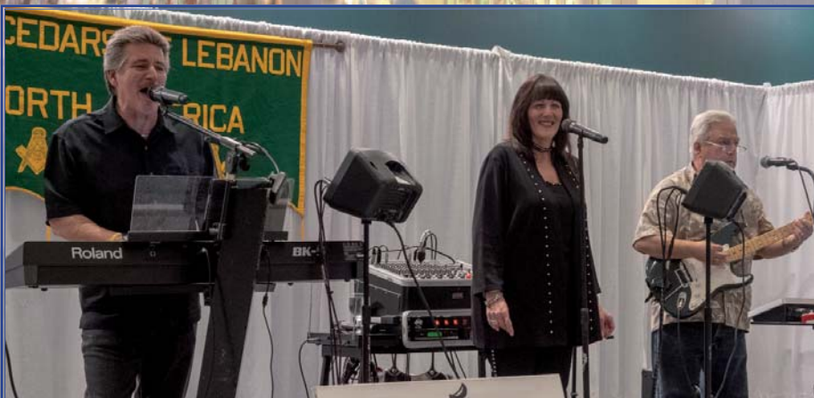
The entertainment for the evening; Just in Time