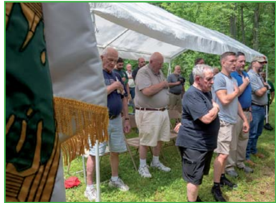
Candidates and members taking the oath and obligation