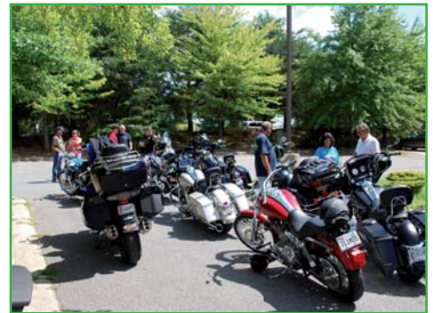
Also included motorcycles.