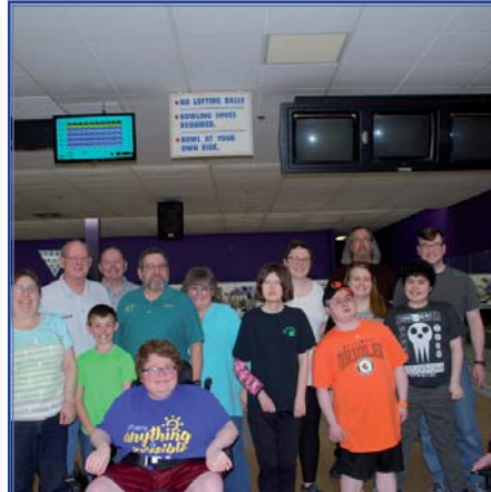
Annapolis sponsored a day of bowling for local young teens and adults.