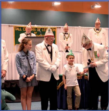
2019 MDA ambassador and family