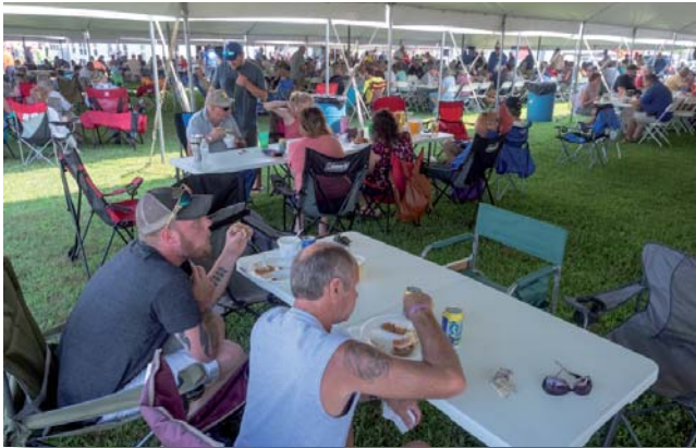
Enjoying the food and companionship