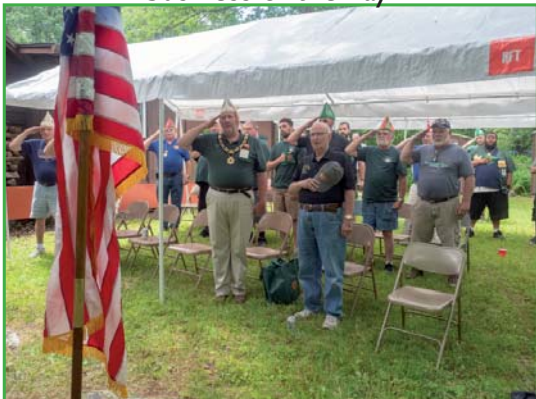
Degree in The Woods Opening