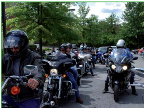
Kick stands up and engines started...Rolling Out.