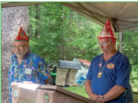
Opening remarks at the Degree in the Woods