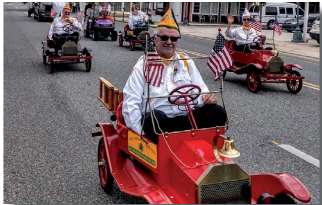
Took 1st Place for Motorized Unit