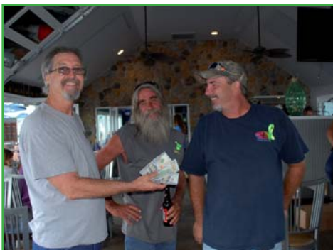
These generous BIKERS donated back their 50/50 winnings and another $300.00 in cash.