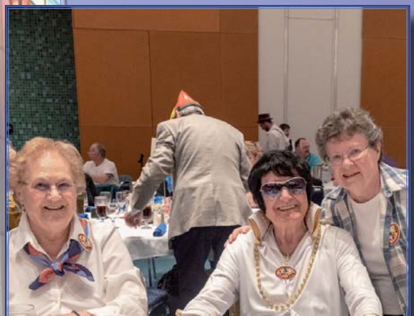
Some very Special guests at the closing dinner