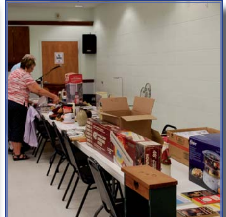
In June we had another successful auction to help fund some of our special MD events