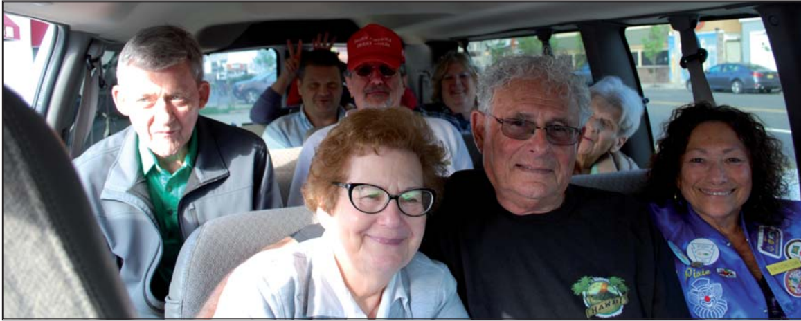
How many members can fit into one Van...???