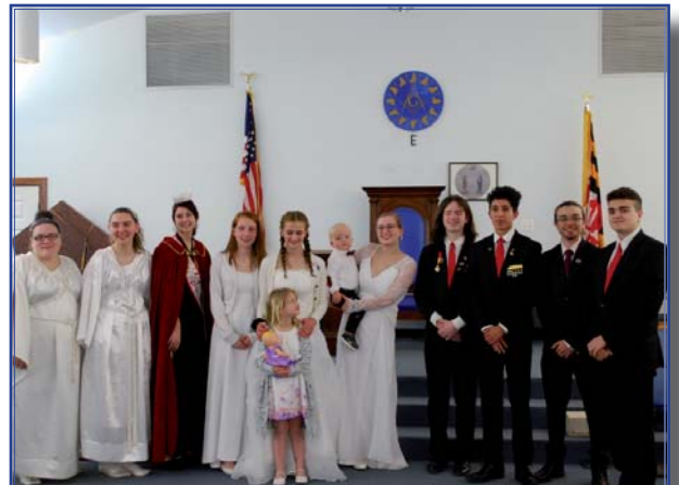
Annapolis Forest had the honor to host Youth Night and have in attendance all 3 Masonic Youth Groups from our area.