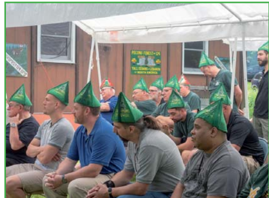
Candidates listening to the story