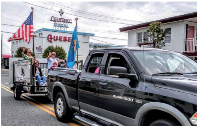
Took 2nd. Place for Misc. Floats