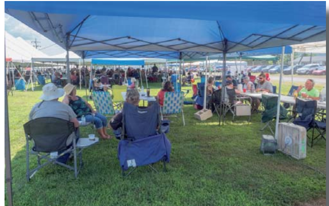
Nice day for a raffle