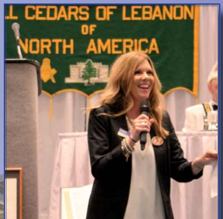
MDA representative addressing the members