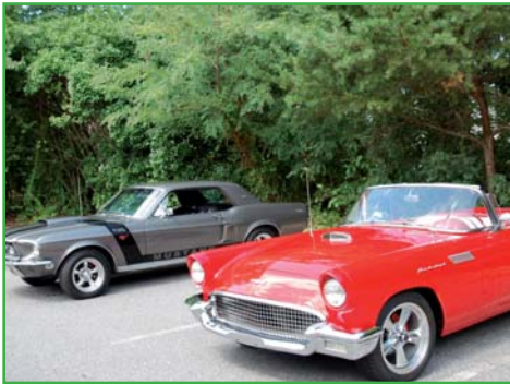
This Fund Raising Event included Muscle Cars.

Annapolis Forest held its 2nd Muscle Run on August 25th and it was bigger and better than last year.