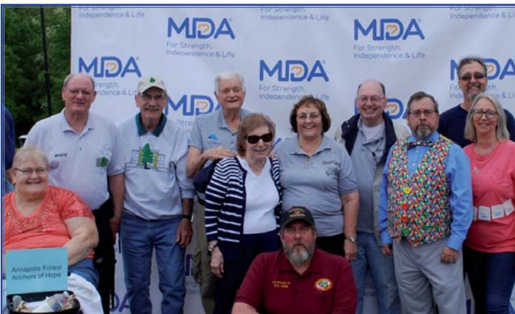
Annapolis Tall Cedar and Cedarette join forces to raise fund and help with the Maryland MDA Muscle Walk.