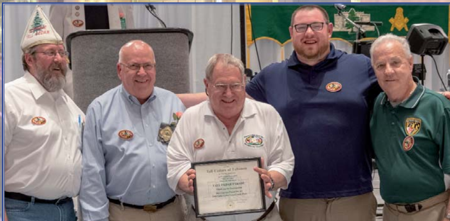
Baltimore Forest accepting the Color guard award