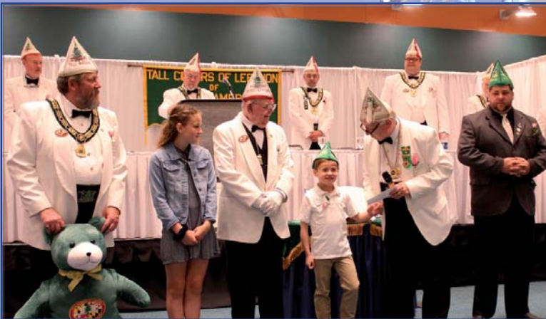
Our MDA ambassador and family for 2019