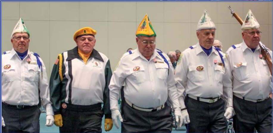
The color guard