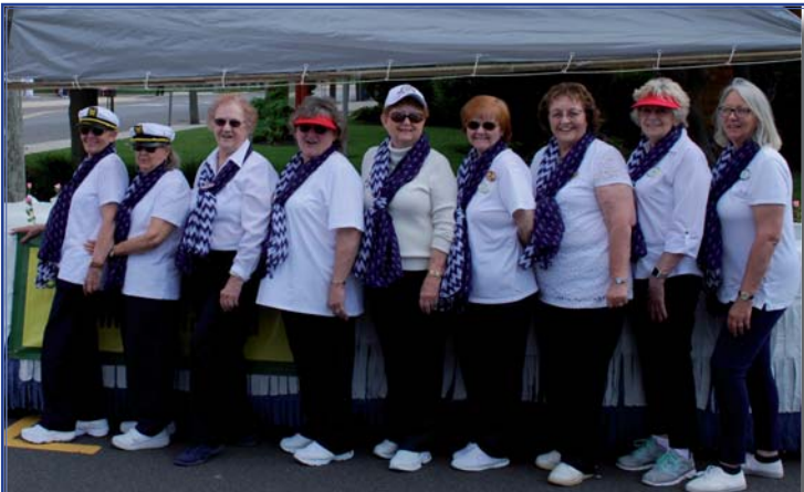
The Annapolis Cedarettes Marching Unit.