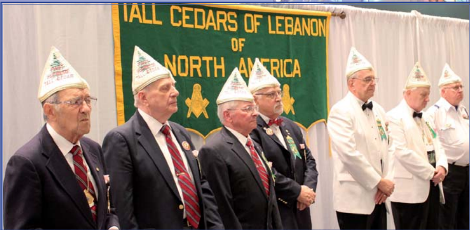
PSTC's waiting to be introduced