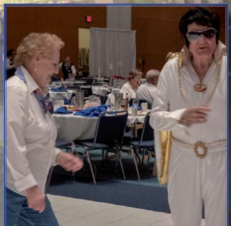
Elvis and his lady dancing