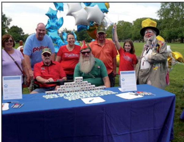
Penn Forest No 21, Main Line Forest No. 153, and Norristown Forest No. 31 Cedars attending the MDA Greater Philadelphia Muscle walk on Saturday June 8, 2019. We were inflating commemorative balloons for the walkers. Approximately 600 people attended the Muscle Walk.