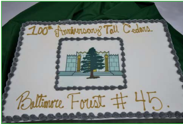
The 100th Anniversary Cake