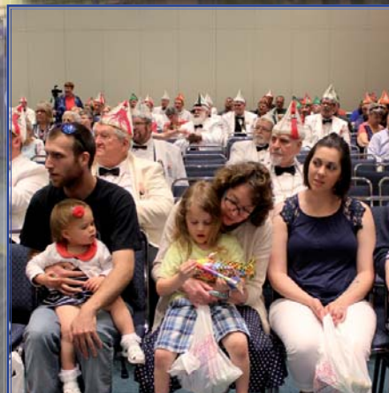
The Metcalf family