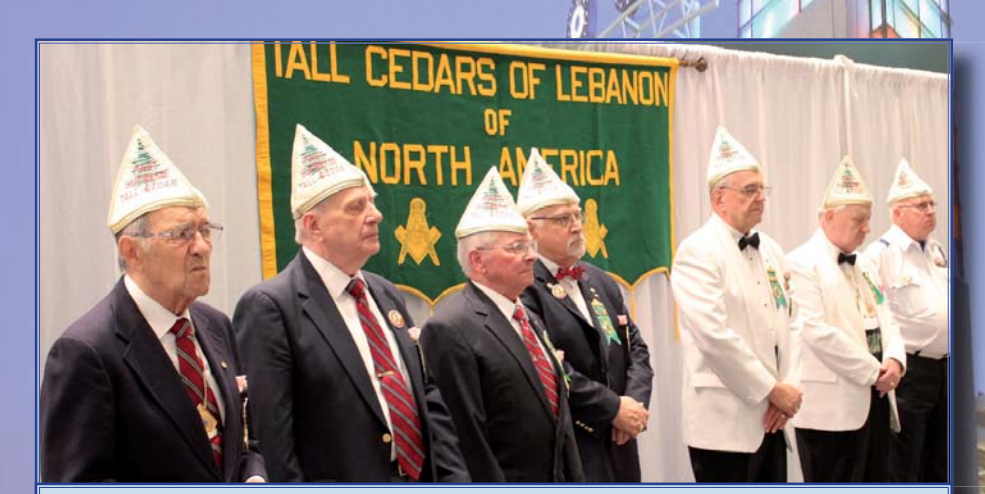
PSTC's waiting to be introduced