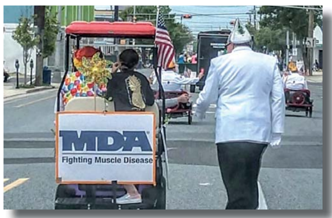
Took 1st Place for M D Float