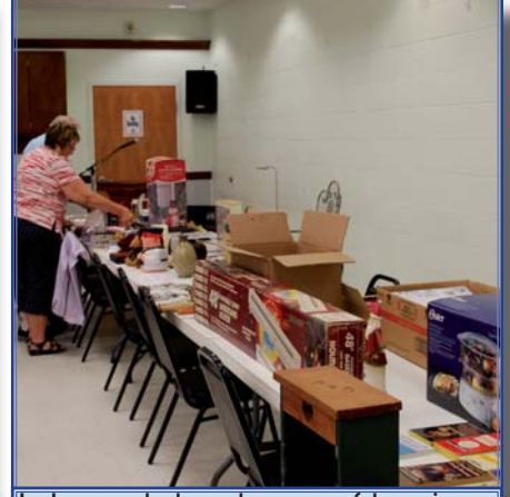
In June we had another successful auction to help fund some of our special MD events