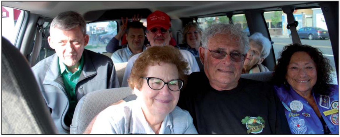
How many members can fit into one Van..???