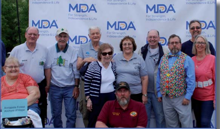
Annapolis Tall Cedar and Cedarette join forces to raise fund and help with the Maryland MDA Muscle Walk.