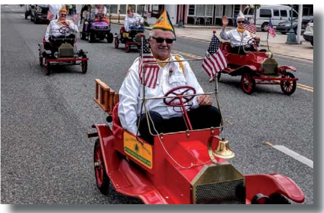
Took 1st Place for Motorized Unit