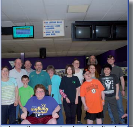
Annapolis sponsored a day of bowling for local young teens and adults.