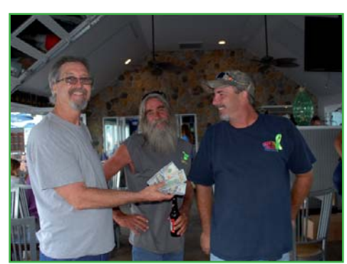
These generous BIKERS donated back their 50/50 winnings and another $300.00 in cash.