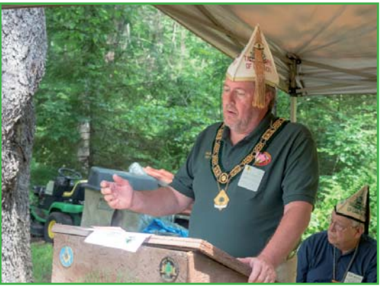
STC Metcalf addressing the members and candidates