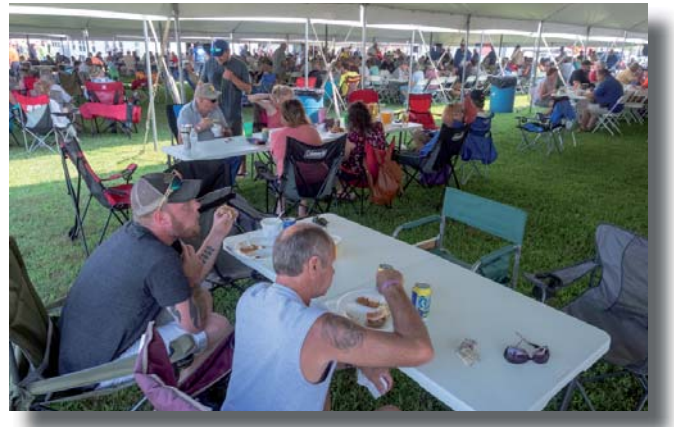
Enjoying the food and companionship