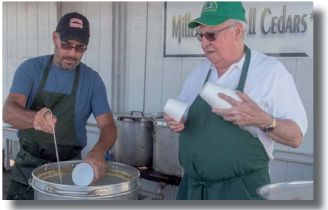
Serving clam chowder