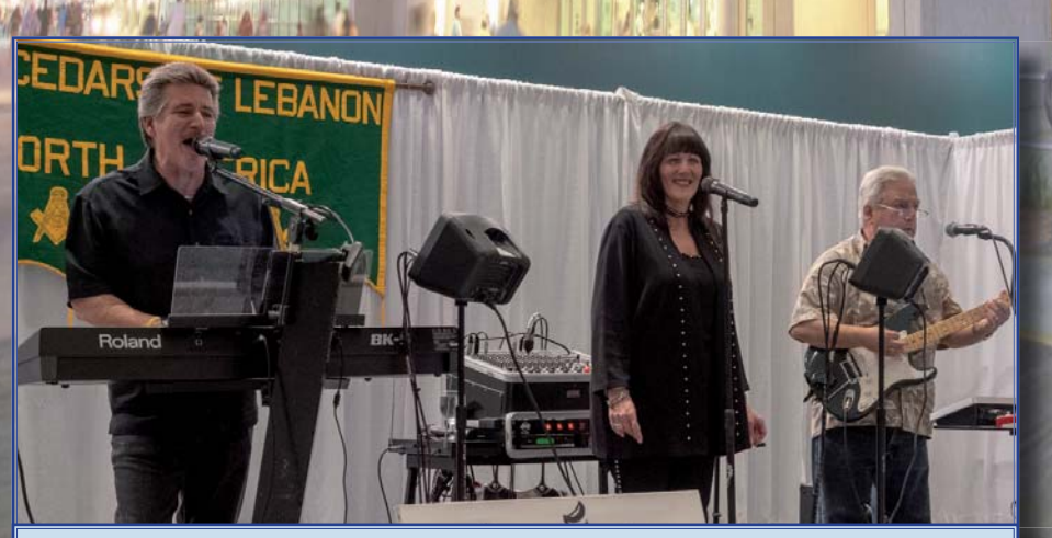
The entertainment for the evening; Just in Time