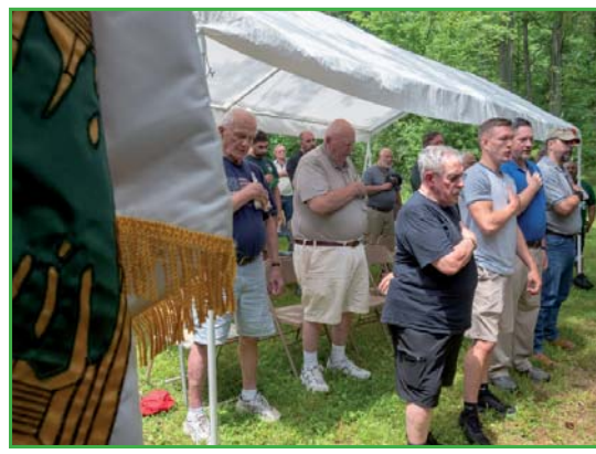
Candidates and members taking the oath and obligation