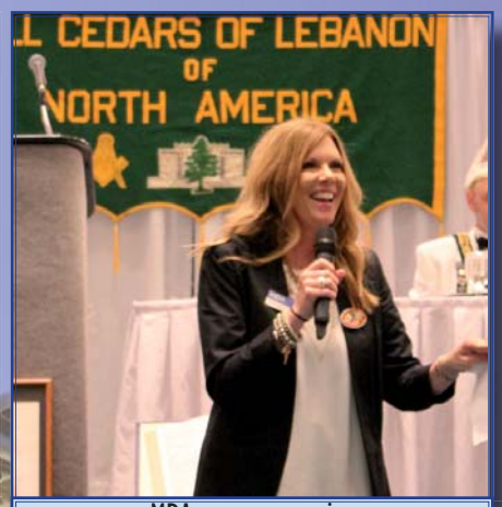
MDA representative addressing the members