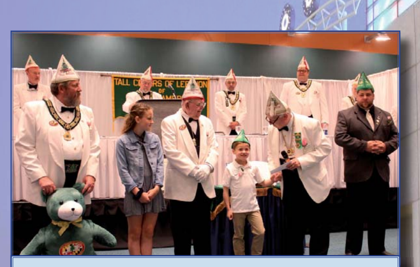
Our MDA ambassador and family for 2019