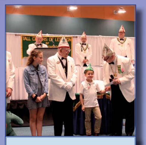
2019 MDA ambassador and family