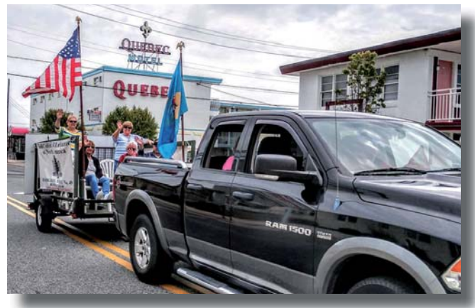
Took 2nd. Place for Misc. Floats