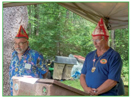
Opening remarks at the Degree in the Woods